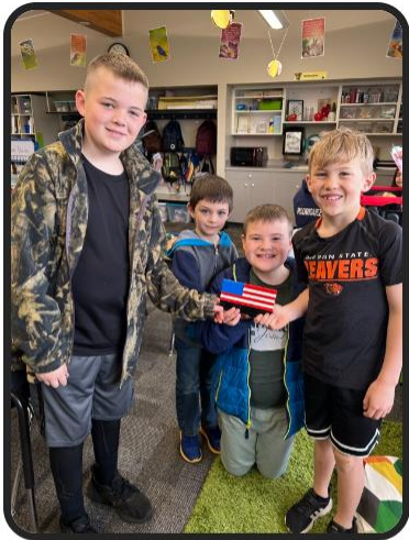
Family Group Fun on Friday First, Second, Third, & Fourth Grades