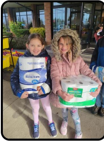
Handing out TP they collected First Grade