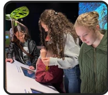
Field Trip to OMSI Class of 2023

Check out the Hood View Adventist School Facebook Page for more photos from school (as soon as the principal can find the time to get them uploaded)